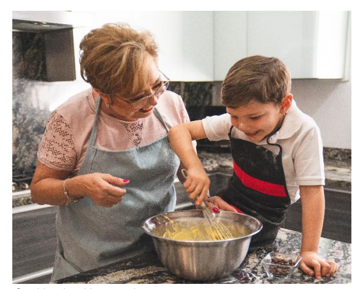
Cooking healthy together

With our volunteer health guides, we are here for homeless families in a shelter in Munich. Our volunteers support those affected through various activities and offerings as part of a holistic health concept.