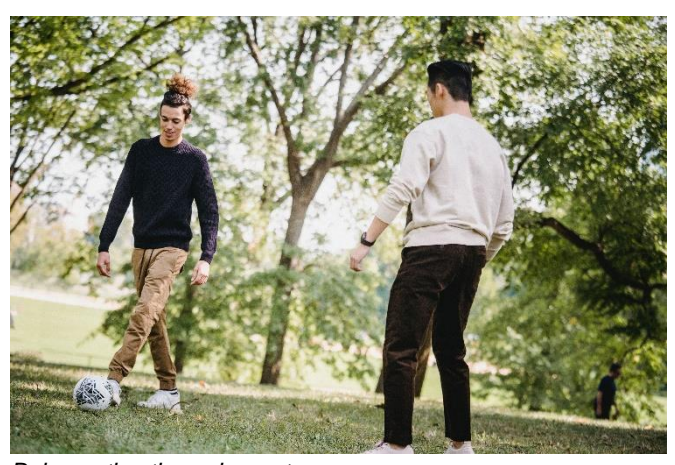
Being active through sports